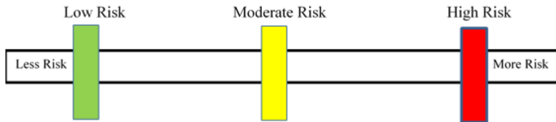
Figure 3. Depiction of risk to designated critical habitat from the stressors of the action

We conclude the Effects of the Action analysis for designated critical habitat by composing a narrative to summarize our evaluation and findings of risk hypotheses. The statement of risk for a species and chemical is carried forward in the integration and synthesis section. The risk statement is presented as a horizontal bar to denote the overall finding for risk and confidence found at the top of a score card.